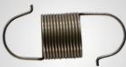
B69 回位弹簧2 Return spring 2