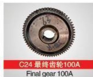
C24 最终齿轮100A Final gear 100A