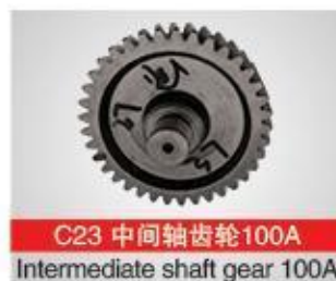
C23 中间轴齿轮100A Intermediate shaft gear 100A