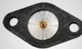
A55 凸轮轴盖 Camshaft cover