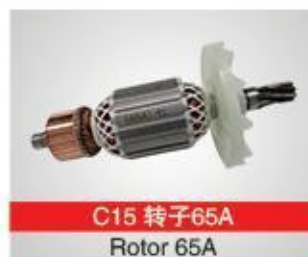
C15 转子65A Rotor 65A