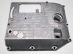
A112 齿轮室盖 Gear case cover