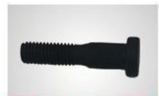
A24 喷油泵螺栓 Oil pump bolt