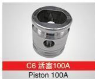
C6 活塞100A Piston 100A