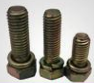
A156 螺栓 Bolt