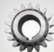
A44 平衡轴齿轮 Balance shaft gear