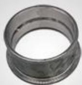
A49 主轴瓦 Main bearing shell