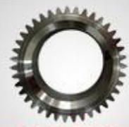
B12 曲轴齿轮 Crankshaft gear