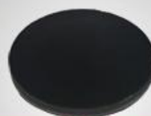
A163 水堵 Water plug