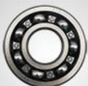
A165 轴承306 Bearing 306