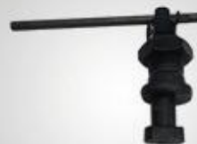
A79 减压总成 Decompressure assy