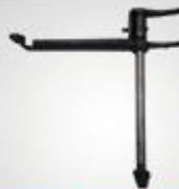
A131 调速杠杆总成 Governor lever assy