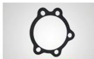
A18 机油泵垫片 Oil pump gasket