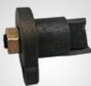
A118 泵油扳手座 Fuel priming handle bushing