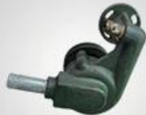
A174 小水泵 4孔 ZS1110 WATER PUMP(4 HOLE) ZS1110