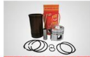
A3 缸套组合 (等离子3环) Cylinder liner kit(plasma 3R)