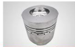
A11 活塞 (3R) Piston(3R)