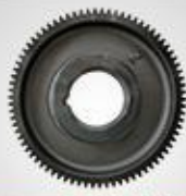
B10 凸轮轴齿轮 Camshaft gear