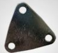
B56 机油泵盖板 Lubricating oil pump cover