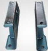
A148 钢板机脚 Steel stand