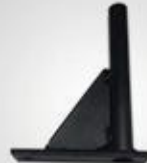
A183 上套管 Upper thimble