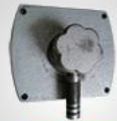
A188 水箱盖板 Water tank cover