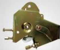
B62 二档手柄 Second gear lever