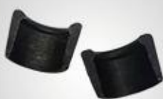
A65 气门锁夹2 Valve collect2