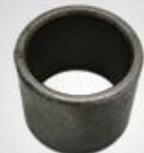
A144 凸轮轴衬套 (后, 小) Camshaft rear bushing(small)