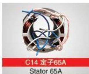
C14 定子65A Stator 65A