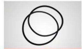
A8 封水圈 water seal ring