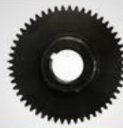
B11 平齿 Flat gear