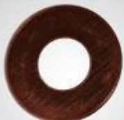
B53 喷油器铜垫 Fuel injector copper packing