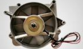
A176 冷凝风扇 Cooling fan