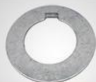
A33 飞轮锁片 Flywheel lock washer