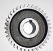
A45 启动齿轮 Starting shaft gear