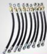
A90 输油管 Delivery fuel pipe