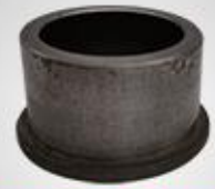
A140 调速衬套 (合金) Governor gear bushing(metal)