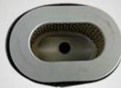
B27 干式空滤芯 Dry air filter element