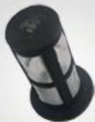
A81 加油滤网 Oil dipstick