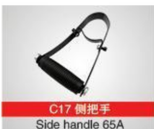
C17 侧把手 Side handle 65A