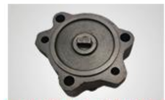
A16 机油泵总成 (钢板) Oil pump(steel)