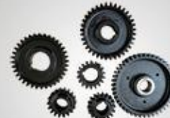
A40 全套齿轮 (发黑) Gear kit(black)