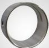
B21 主轴瓦 Main bearing shell