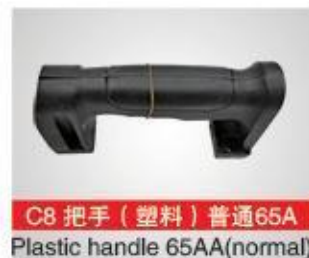
C8 把手 (塑料) 普通65A Plastic handle 65AA(normal)