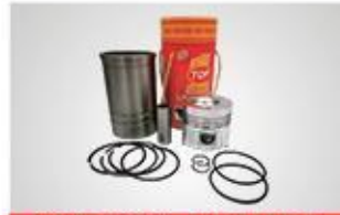
A2 缸套组合 (白亮4环) Cylinder liner kit(white 4R)