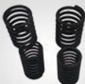
A61 气门内外弹簧1 IN/EX.Valve spring1