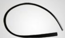
B72 减震条 Article damping