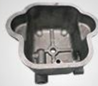
A75 缸罩 (铝) Cylinder head cover(AL)