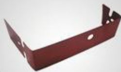
A181 油箱支架 Fuel tank frame