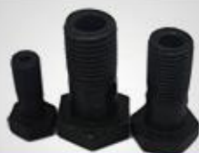
A154 管接螺栓 Pipe connecting bolt