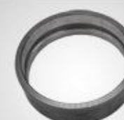
A48 曲轴衬套 Crankshaft bushing