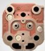
A70 汽缸盖 Cylinder head