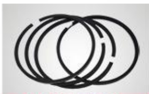
A13 活塞环 (4R) Piston ring(4R)