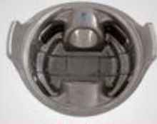
B2 活塞 Piston