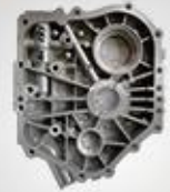
B28 侧盖 Side cover