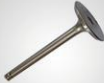
B14 进气门 Intake valve