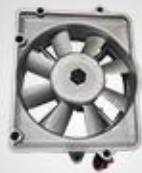
A170 风扇电机 Fan generator