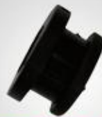
B67 导风罩减震套 Air guide hood damping sleeve