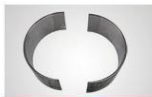
A22 连杆瓦 Connecting rod shell