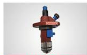
A23 喷油泵 Fuel injection pump