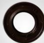
B47 拨叉油封 Shifting fork oil seal