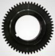
B9 平传齿 Parallel gear