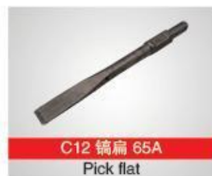
C12 镐扁 65A Pick flat