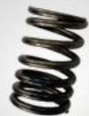
B16 气门弹簧 Valve spring