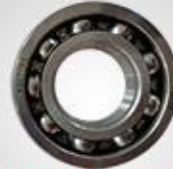
B31 6308轴承 Bearing 6308