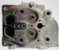
B13 汽缸盖 Cylinder head