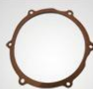
A95 主轴承盖垫片 Main bearing cover packing