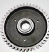
A43 调速轴齿轮 Governor shaft gear