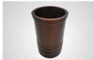
A6 缸套 (等离子) Cylinder liner(plasma)