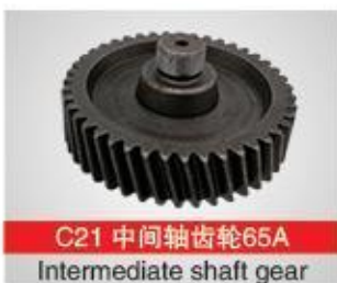
C21 中间轴齿轮65A Intermediate shaft gear