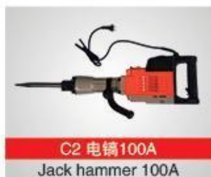
C2 电镐100A Jack hammer 100A