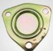
A53 平衡轴盖 Balance shaft cover