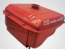
A82 油箱 Fuel tank