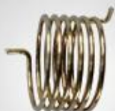
B70 回位弹簧1 Return spring 1