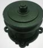
A175 小水泵泵头 Water pump head