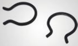
A98 摇臂卡簧 Rocker arm clip