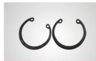
A15 活塞销挡圈 Piston pin circlip