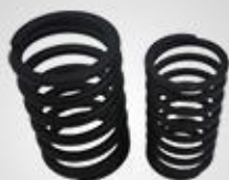
A62 气门内外弹簧2 IN/EX.Valve spring2