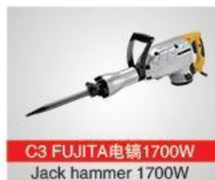
C3 FUJITA电镐1700W Jack hammer 1700W