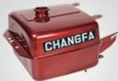
A177 冷凝水箱 Condenser fuel tank