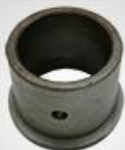
A141 起动轴衬套 (甲, 大) Starting shaft bushing(big)