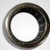
B54 滚针轴承 Needle roller bearing