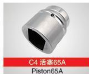
C4 活塞65A Piston65A