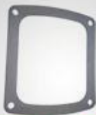
A162 水箱漏斗垫片 Hopper funnel gasket