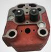
A69 汽缸盖总成 Cylinder head assy