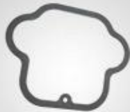
A77 缸罩垫片 Cylinder head cover gasket