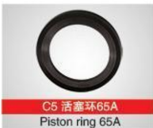
C5 活塞环65A Piston ring 65A