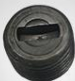
A30 曲轴油塞 Crankshaft oil plug