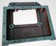
A185 下水箱 Lower water hopper