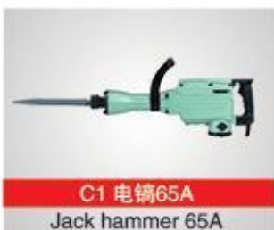
C1 电镐65A Jack hammer 65A