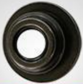
B17 气门弹簧垫 Valve spring gasket