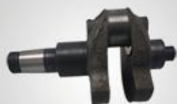
A29 曲轴 Crankshaft