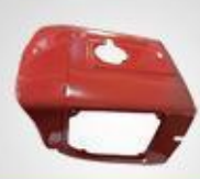
A180 冷凝大罩 Condenser cover