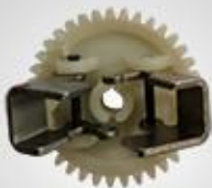
B37 传动齿轮 Driving gear