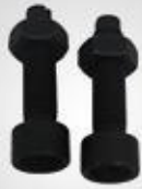
A97 摇臂螺栓+螺母 Rocker arm bolt&nut