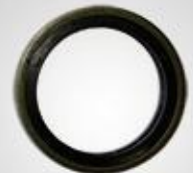
B64 飞轮垫片 Flywheel gasket