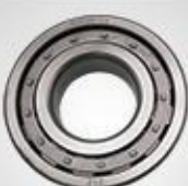
A166 轴承NJ312E Bearing NJ312E