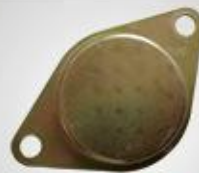
B55 电气动盖板 Electropneumatic cover plate