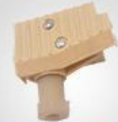
A116 呼吸器 Breather