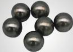
A146 钢球 Steel ball