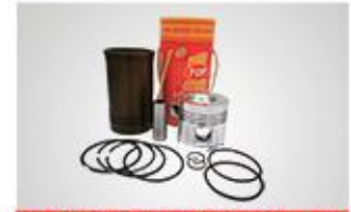
A4 缸套组合 (等离子4环) Cylinder liner kit(plasma 4R)