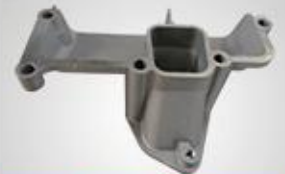
B20 进气管 Intake pipe