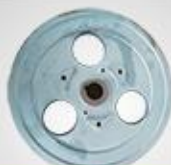
A34 飞轮 Flywheel