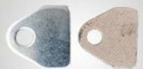
B44 密封垫盖板 密封垫垫片 Gasket cover Gasket