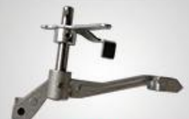
B48 拨叉 Shifting fork