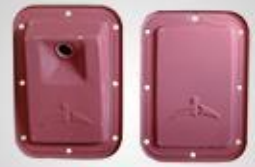
A152 后盖 Rear cover