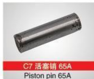
C7 活塞销 65A Piston pin 65A