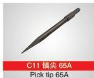
C11 镐尖 65A Pick tip 65A