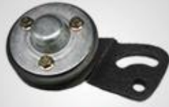
A186 张紧轮总成 Tension pulley