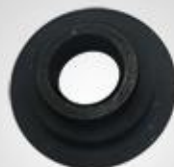
A63 气门弹簧座 Valve spring seat