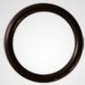
B49 O型圈 O ring