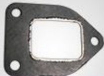
A130 排气管垫片 Exhaust pipe packing