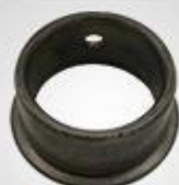
A142 起动轴衬套 (乙, 小) Starting shaft bushing(small)