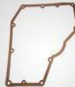
A115 齿轮室盖垫片 Gear case cover gasket