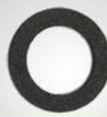
A83 指示器接头垫 Oil indicator packing