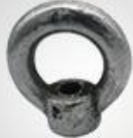
A126 吊环 Lifting eye