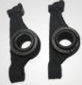
A100 摇臂含衬套 Rocker arm with bush