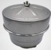
A122 空滤 (铁) Air filter(iron)