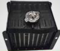
A178 散热器 Radiator