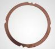
B40 汽缸盖罩垫 Cylinder cover gasket