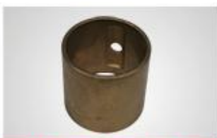
A21 连杆衬套 (铜) Connecting rod bushing(copper)