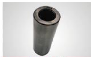
A14 活塞销 Piston pin