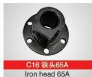
C16 铁头65A Iron head 65A