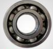
B32 6207轴承 Bearing 6207