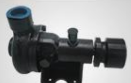
A168 KSK-1黑色小水泵 KSK-1 black small pump