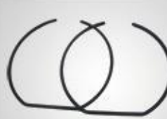
A167 轴承挡圈 Bearing circlip