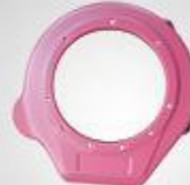
B23 导风罩 Wind scooper