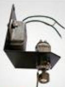
A190 电起动开关总成 Electric start switch