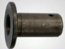
B36 调速推盘 Governor push plate