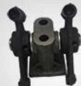
A96 摇臂总成 Rocker arm seat