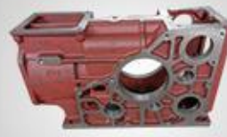
A119 机体 Cylinder block