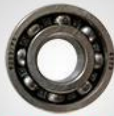
B30 6203轴承 Bearing 6203