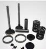
A58 气门组合 Valve kit