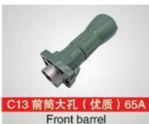
C13 前筒大孔 (优质) 65A Front barrel