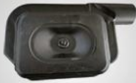
B26 干式空滤 Dry air filter