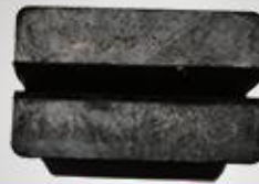
B59 减震块 Damping block