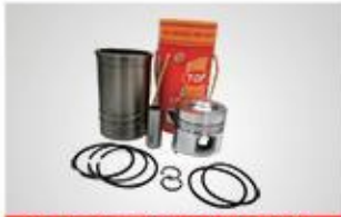
A1 缸套组合 (白亮3环) Cylinder liner kit(white 3R)