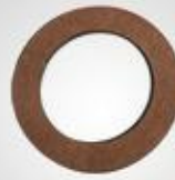
A135 调速滑盘垫片 Governor ball race gasket