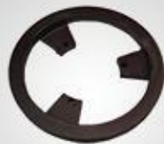
A182 大皮带轮 Big belt pulley