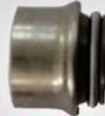
B19 气门油封 Valve oil seal