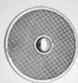
A86 机滤网 Oil filter screen