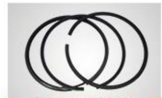
A12 活塞环 (3R) Piston ring(3R)