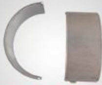
B6 连杆瓦 Connecting rod shell