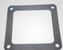
A160 水箱垫片 Hopper packing