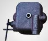
A76 缸罩总成 Cylinder cover assy