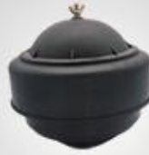
A123 空滤 (塑料) Air filter(plastic)