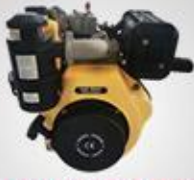
B1 186FA 风冷柴油机 186FA Air cooled diesel engine