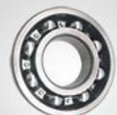
A164 轴承 Bearing