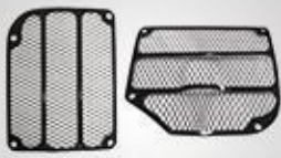
A169 网片 Windows net