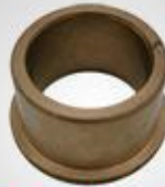
A139 调速齿轮衬套 (铜) Governor bush(copper)