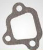
B42 油滤式空滤垫 Air filter packing