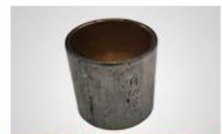
A20 连杆衬套 (合金) Connecting rod bushing(metal)