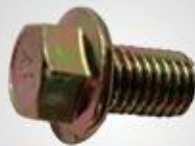
B66 螺栓 Bolt