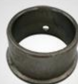
A143 凸轮轴衬套 (前, 小) Camshaft front bushing(small)