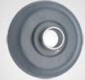
A136 调速滑盘 Governor ball race