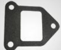
A128 进气管垫片 Intake pipe packing