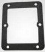
A121 上盖垫片 Upper cover gasket