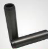
A67 气门导管 Valve guide