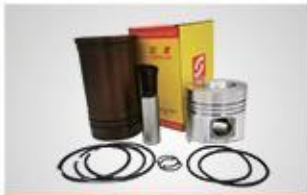
A5 缸套组合 Strongmax 3R