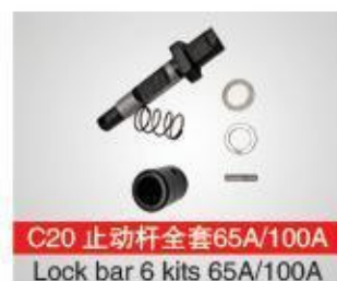
C20 止动杆全套65A/100A Lock bar 6 kits 65A/100A