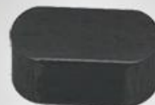
A32 曲轴平键 Crankshaft flat key