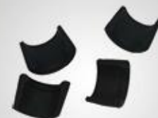
A64 气门锁夹1 Valve collect1