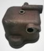
A74 缸罩 (铁) Cylinder cover(iron)