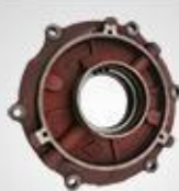
A94 主轴承盖 Main bearing cover