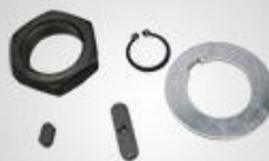
A31 曲轴五小件 Crankshaft 5 kit