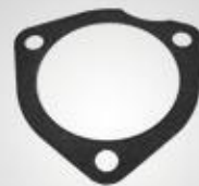
A52 平衡轴轴盖垫片 Balance shaft cover gasket