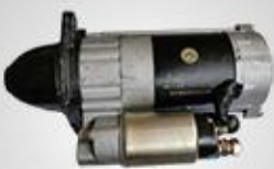
A189 起动马达QD1202A Starting alternator QD1202A