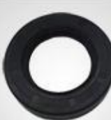
A47 启动轴油封 Starting shaft oil seal