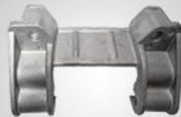
B38 上支架 Upper bracket