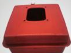
A158 水箱 Water hopper