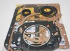
A37 全套垫片 (豪华款) Gasket set with rubber