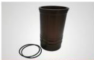
A9 缸套 (封水圈) Line kit with water seal ring