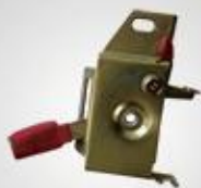
B61 意大利手柄 Italy handle