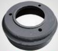
A149 皮带盘10" Pulley 10"