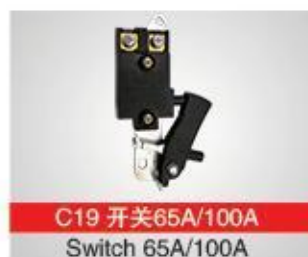
C19 开关65A/100A Switch 65A/100A