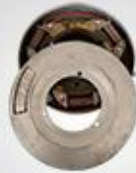
A171 飞轮发电机150W Flywheel generator 150W