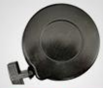
B8 手拉盘 Hand-disk