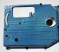
A111 齿轮室盖(直角) Gear case cover(vertical angle)