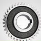
A42 凸轮轴齿轮 Camshaft gear