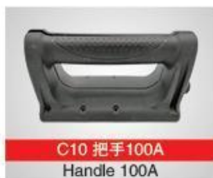
C10 把手100A Handle 100A