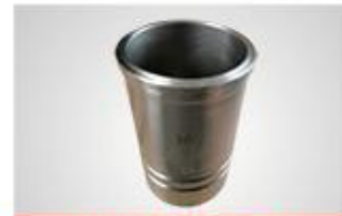
A7 缸套 (白亮) Cylinder liner(white)