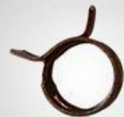
B68 M13卡箍 M13 Clamp