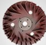
B63 飞轮 Flywheel