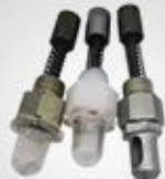
A78 机油指示器总成 Oil indicator assy