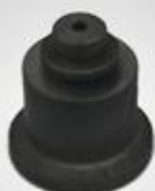
A26 出油阀偶件 Delivery valve