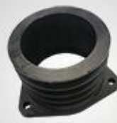
A147 皮带盘10寸 Belt pulley 10"