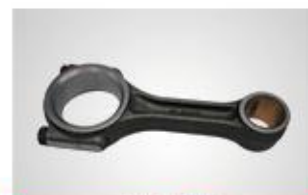
A19 连杆 Connecting rod