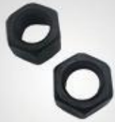
A73 缸盖螺母 Cylinder head nut