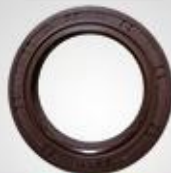
B46 油封 Oil seal