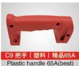
C9 把手 (塑料) 精品65A Plastic handle 65A(best)