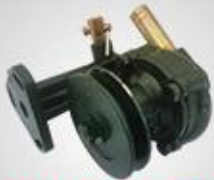
A173 小水泵 3孔 ZS1110 WATER PUMP(3 HOLE) ZS1110