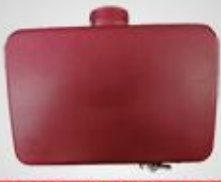
B25 活塞总成6.5HP Piston assy.6.5HP