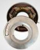
A172 飞轮发电机90W Flywheel generator 90W