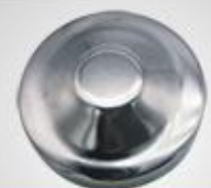
A84 油箱盖 Fuel tank cover