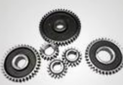
A39 全套齿轮 (白亮) Gear kit(white)