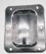
A120 上盖 Upper cover