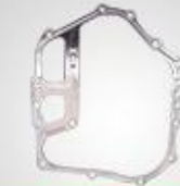
B43 侧盖垫 Side cover gasket