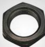
A35 飞轮螺母 Flywheel nut