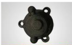
A17 机油泵总成 (一体) Oil pump assy.(comp.)