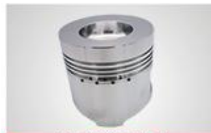
A10 活塞 (4R) Piston(4R)