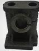
A99 摇臂座 Rocker arm seat