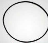
A191 三角皮带 V-belt