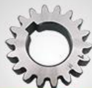
A41 曲轴正时齿轮 Crankshaft timing gear