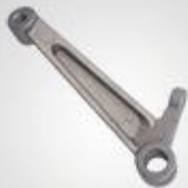
A133 调速连接杆 (铝) Governor con.rod(AL)