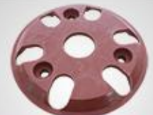
A132 调速支架 Governor ball spacer