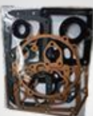
A38 全套垫片 (简装) Gasket set