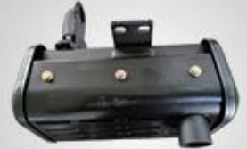
B24 消声器总成 Silencer assy