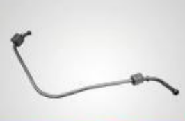
A92 高压油管 High pressure pipe