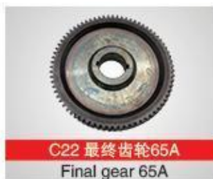
C22 最终齿轮65A Final gear 65A