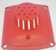
A161 水箱漏斗 Hopper funnel