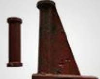
A184 下套管 Lower thimble