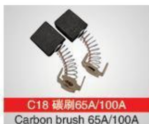
C18 碳刷65A/100A Carbon brush 65A/100A