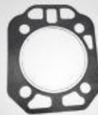
A71 汽缸盖垫片 Cylinder head gasket