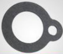
A113 油泵扳手座垫片 Fuel priming handle seat packing