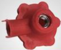
A137 调速手柄 Speed-control lever knob